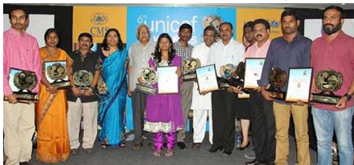
6 th UNICEF Awards function for Children-Related Programmes in Telugu Television Channels