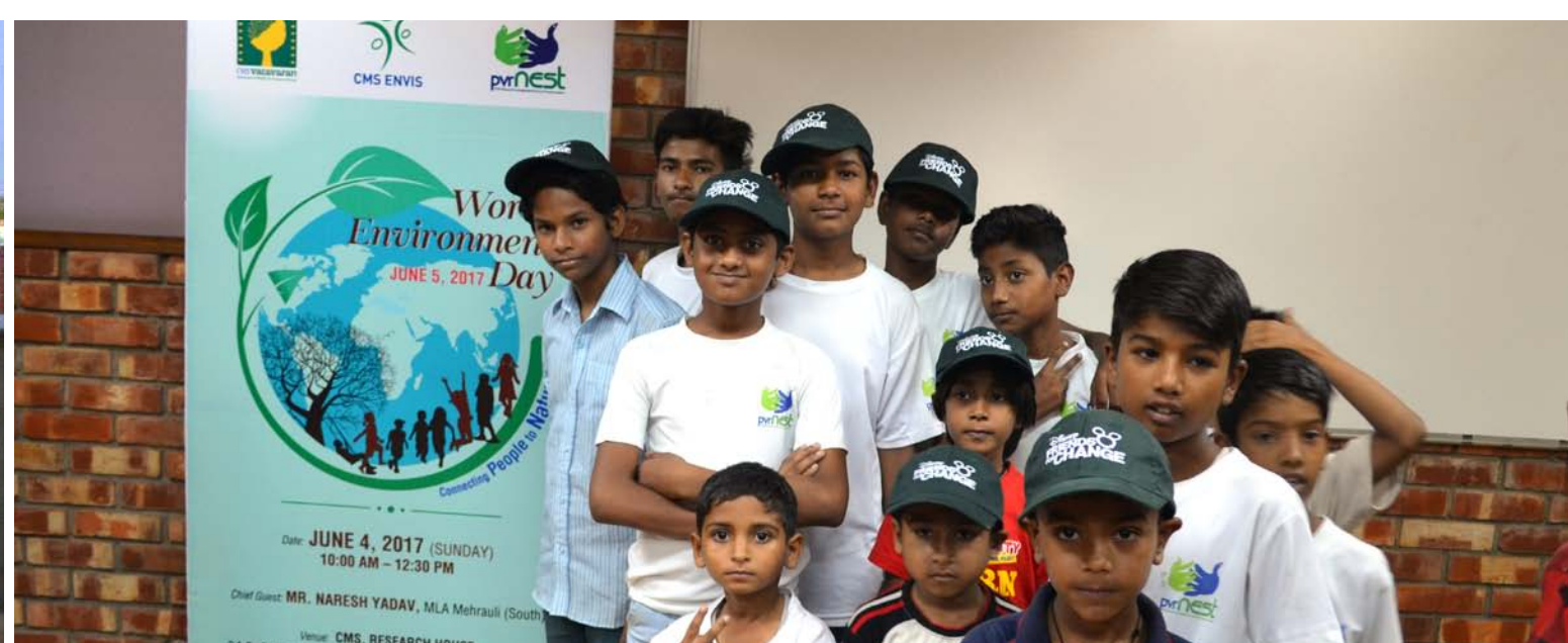
CMS VATAVARAN and CMS Envis Centre in collaboration with Childscapes of PVR Nest celebrated World Environment Day on 4th June, 2017 at CMS Office, Saket.