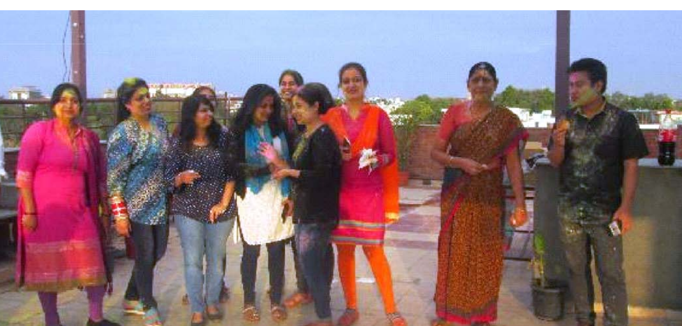
CMS Staff enjoyed a Holi Celebration on March 13, 2017 at CMS Office.