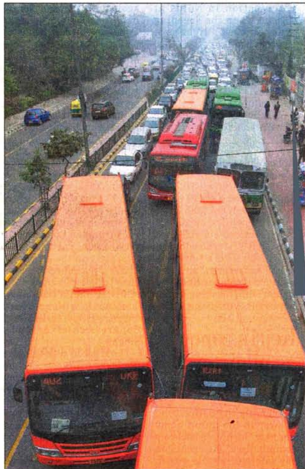
■ DTC buses are not only the cause of accidents but also block traffic by diverting from their designated lanes in the race to pick the maximum number of passengers.

"DTC buses are run by three types of drivers - permanent drivers, Delhi Subordinate Services Selection Board (DSSSB)-